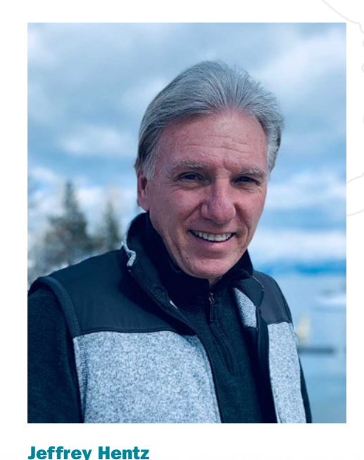
CEO North Lake Tahoe Resort Association, Chamber of Commerce & CVB